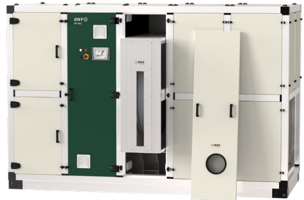
Flexisorb unit RF-102

DST is a Swedish company, founded in 1985. We are now a leading international supplier of desiccant dehumidifiers. DST has been a subsidiary of Japanese company Seibu Giken Co Ltd since 1993. DST is currently represented in over 40 countries throughout the world. Seibu Giken Co manufactures dehumidifier rotors, VOC rotors, heat exchangers and more.